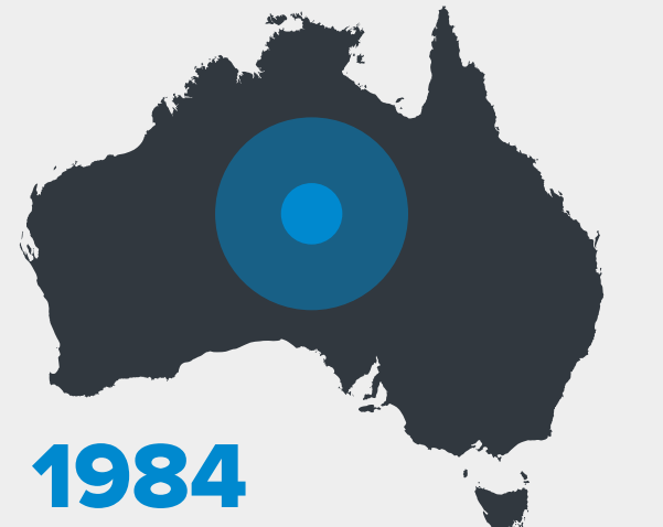
15.6m | 1.58m