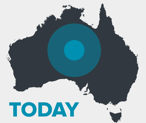
23.6m | 3.45m